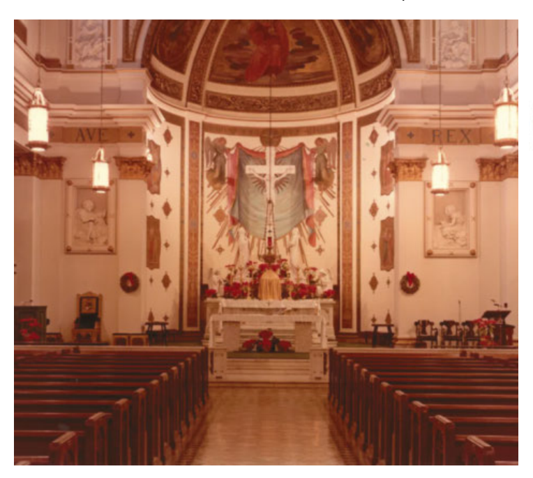
The Cathedral of the Incarnation altar adorned for Christmas in 1975.

The tabernacle was returned to the altar of repose in 2021.