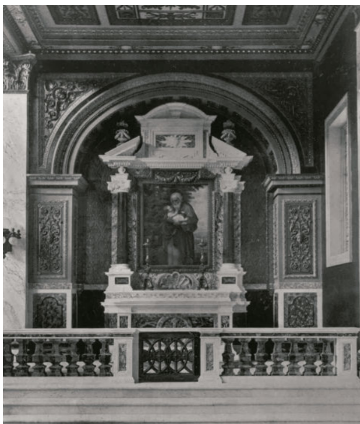
The Saint Joseph Chapel (Originally on the west side of the sanctuary)