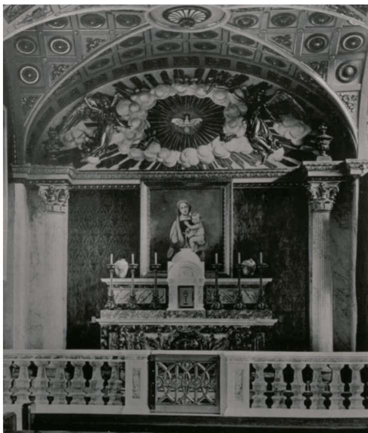
The Saint Mary Chapel (Originally on the east side of the sanctuary)

In 1937 the St. Mary chapel replaced the altar boy sacristy and the second floor choir room that were part of the original floor plan. The altar was also made of marble from Carrera, Italy and contained the relic of St. Bonosus. In this chapel was the art glass window depicting the scene from the childhood of Mary, where she is being instructed in the faith of the Jewish people by her mother St. Ann. That window is still there today. There was a statue of Mary standing above the world looking down with loving concern on the people of the world seen in the painting behind the statue. The painting had figures representing men, women and children of every race of people in the world. There were angels on either side of the altar bringing glad tidings to the shepherds of the birth of Jesus. Over the statue were the words "Ave Maria, Ora Pro Nobis"- Hail Mary, Pray for Us. The words "Salve Regina" were painted on the wall reinforcing the theme of her queenship.